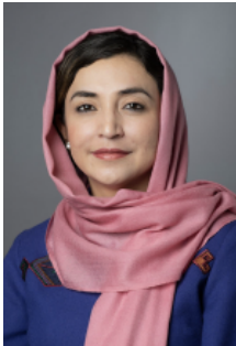
Adela Raz, Ambassador of the Islamic Republic of Afghanistan to the United States of America, “Afghanistan, A View to the Future”