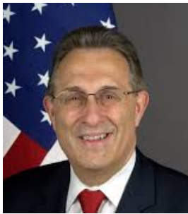
Ambassador Earl Anthony "Tony" Wayne , formerly Assistant Secretary of State for Economic and Business Affairs; United States Ambassador to Argentina and Mexico; Deputy United States Ambassador to Afghanistan, "Building a Partnership with Mexico"