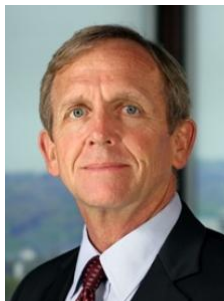
Admiral Eric Olson , United States Navy (Retired), Former Commander of the U.S. Special Operations Command and Four-Star Admiral Navy SEAL, “The World at Night”