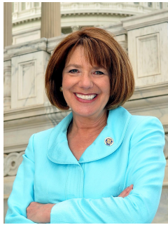
Susan A. Davis, United States Congresswoman, “Beyond the Beltway: A Perspective on the Value of Global Engagement”