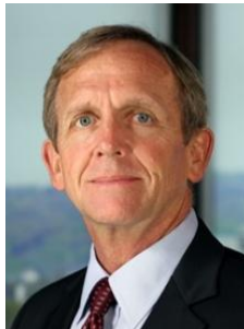
Admiral Eric Olson , United States Navy (Retired), Former Commander of the U.S. Special Operations Command and Four-Star Admiral Navy SEAL, "The World at Night"