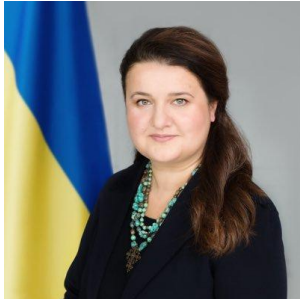
Oksana Markarova, Ambassador of Ukraine to the United States of America, Ukraine- U.S., A Strategic Partnership