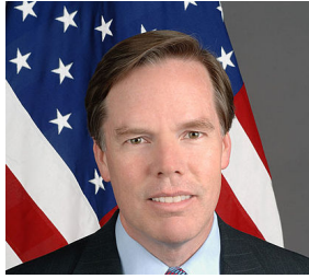
Ambassador Nicholas Burns , Former United States Ambassador to NATO and former U.S. Ambassador to Greece; Professor, Harvard University, John F. Kennedy School of Government