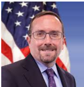
Ambassador John Bass , Current United States Ambassador to Turkey; Former United States Ambassador to Georgia