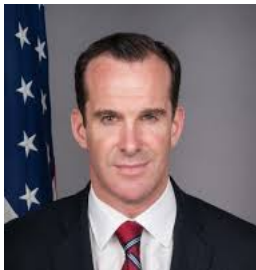
Brett McGurk, former Special Presidential Envoy for the Global Coalition to Defeat ISIS, "Three Presidents at War"