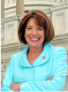
Susan A. Davis, United States Congresswoman, "Beyond the Beltway: A Perspective on the Value of Global Engagement"