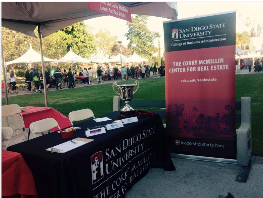
Staff attended the Explore SDSU Open House this spring. The all-campus event features an information fair, academic program workshops, tours and open houses. It was a great opportunity to meet incoming Real Estate majors.