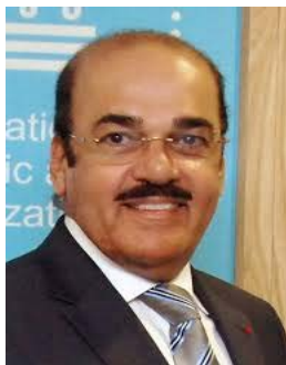
Ambassador Naser M.Y. Al Belooshi , PhD., Ambassador of the Kingdom of Bahrain to the United States; Ambassador of the Kingdom of Bahrain to France