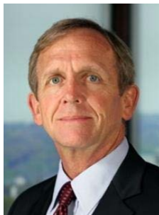
Admiral Eric Olson , United States Navy (Retired), Former Commander of the U.S. Special Operations Command and Four-Star Admiral Navy SEAL, “The World at Night”