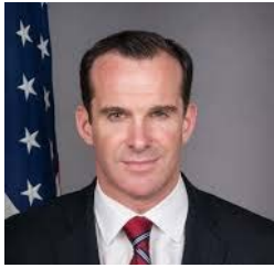
Brett McGurk , former Special Presidential Envoy for the Global Coalition to Defeat ISIS, “Three Presidents at War”