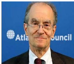
Ambassador Daniel Fried , former United States Ambassador to Poland, Weiser Family Distinguished Fellow, Atlantic Council, “The Fall of the Wall- 30 Years Later”