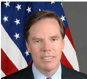
Ambassador Nicholas Burns , Former United States Ambassador to NATO and former U.S. Ambassador to Greece; Professor, Harvard University, John F. Kennedy School of Government